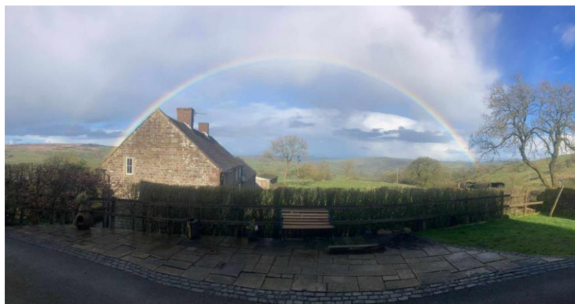
Hill Farm, Butterton