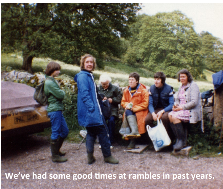
We've had some good times at rambles in past years.