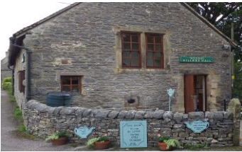
"Victorian Style Tea Room" In the Old Village School