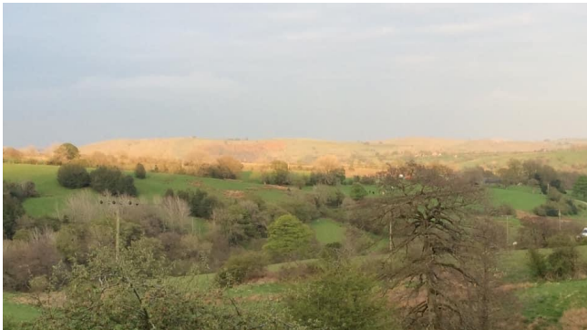
Evening sun over Ecton Hill from Mount Pleasant