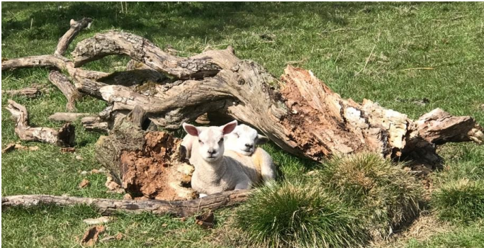
Lambs resting in the sunshine

At last it's beginning to really feel like spring now that the cold winds and night-time frost seem to be behind us. I have my fingers crossed at this point! The daffodils in Lower Elkstone have been beautiful as always and now the bluebells are at their best - a little late this year but very welcome none-the-less. The swallows swooping, the sound of the curlews, the perfume of the bluebells and wild garlic, the lambs fattening and the cows back in the fields all help to bring optimism back into our lives, not to mention the opportunity to socialise indoors again and no longer have to freeze in the pub garden! We hope that 21st June will bring a further return to normal life - whatever that may be. Unfortunately not everyone is able to fully enjoy the season and we extend our thoughts to those still suffering the after-effects of Covid in whatever way.