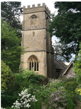
The beautiful Norman church of St John the Evangelist in Elkstone, Gloucestershire