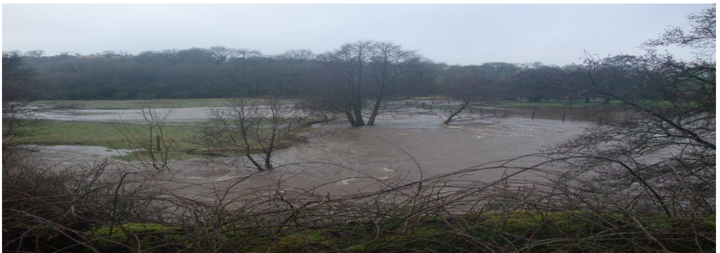
A photograph taken in Ecton, in February, showing the “River Ec” overflowing its banks.