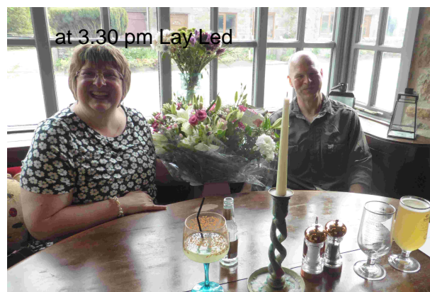
at 3.30 pm Lay Led