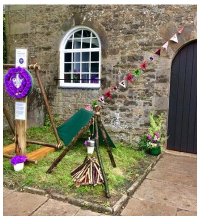
....and last year's