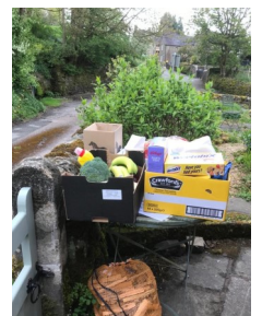
Hartington Village Stores delivery waiting to be collected from Chapel House