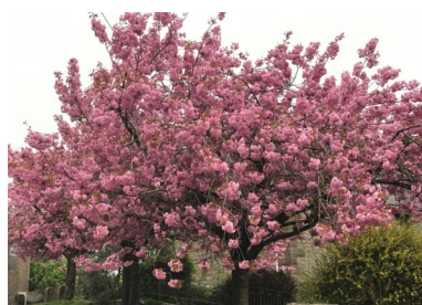
Des and Myrtle's beautiful blossom trees

....and of course lambing time, keeping our farmers busy