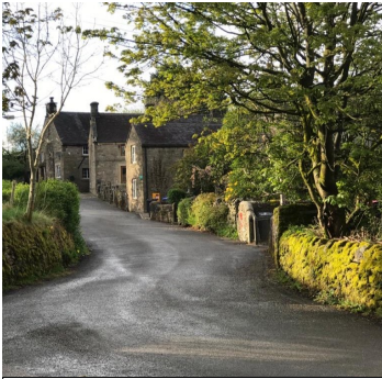
The lane through Upper Elkstone looking very quiet during lockdown

We thought this would be a slimmed-down newsletter reflecting the absence of church and social activities due to the Corona Virus. As you'll see, there's still plenty happening behind the scenes. Happily we have not yet heard of any cases in the village but obviously we are all remaining careful when shopping, receiving deliveries and contacting each other. It's heartening that so many people have listened to the messages about staying safe. There have been the added benefits for Elkstones of the extra peace and quiet from less traffic and fewer planes overhead, the time to appreciate the beautiful natural world around us and the kindness of neighbours in helping each other out during lockdown. In addition we've experienced such glorious April sunshine that many of us have taken the opportunity to be busy in our gardens. Many others, parents, farmers and local businesses must carry on regardless so thank you to all of you and we hope that the past month hasn't been too stressful.