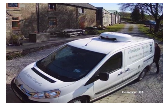
Hartington Cheese Shop dropping off at Cave Farm